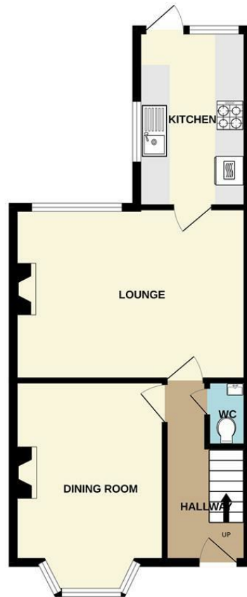
GROUND FLOOR 466 sq.ft. (43.3 sq.m.) approx.